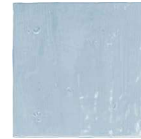
32017 NADOR SKY/13,2X13,2 Q44 (13,2x13,2 cm — 5 3 / 16 x5 3 / 16 "*) 50 patterns