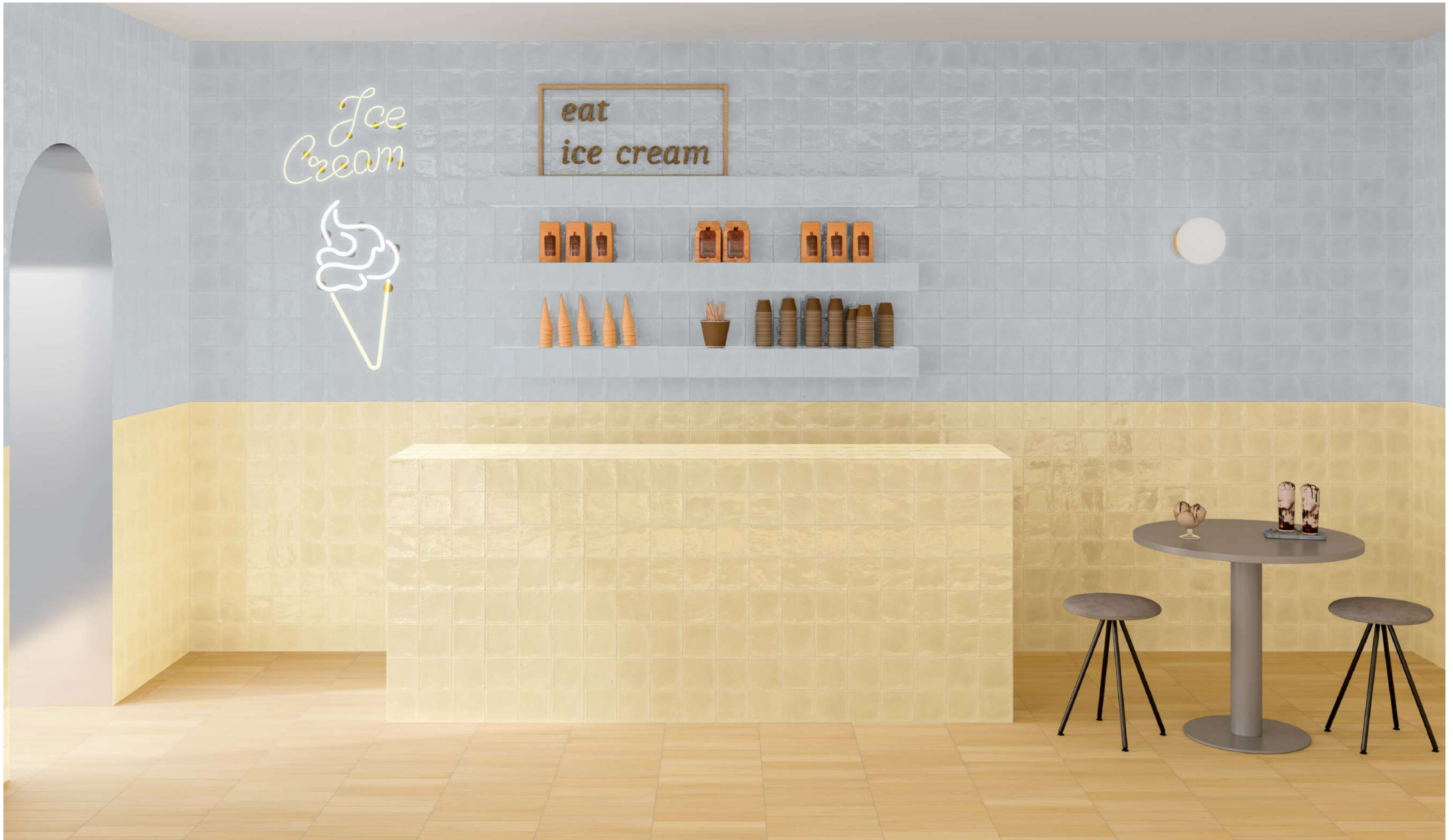
NADOR SILVER/13,2X13,2 · NADOR YELLOW/13,2X13,2 · NIZAMUSTARD/9,2X37