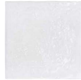
32015 NADOR WHITE/13,2X13,2 Q44 (13,2x13,2 cm — 5 3 / 16 x5 3 / 16 "*) 50 patterns