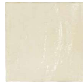
32022 NADOR YELLOW/13,2X13,2 Q44 (13,2x13,2 cm — 5 3 / 16 x5 3 / 16 "*) 50 patterns