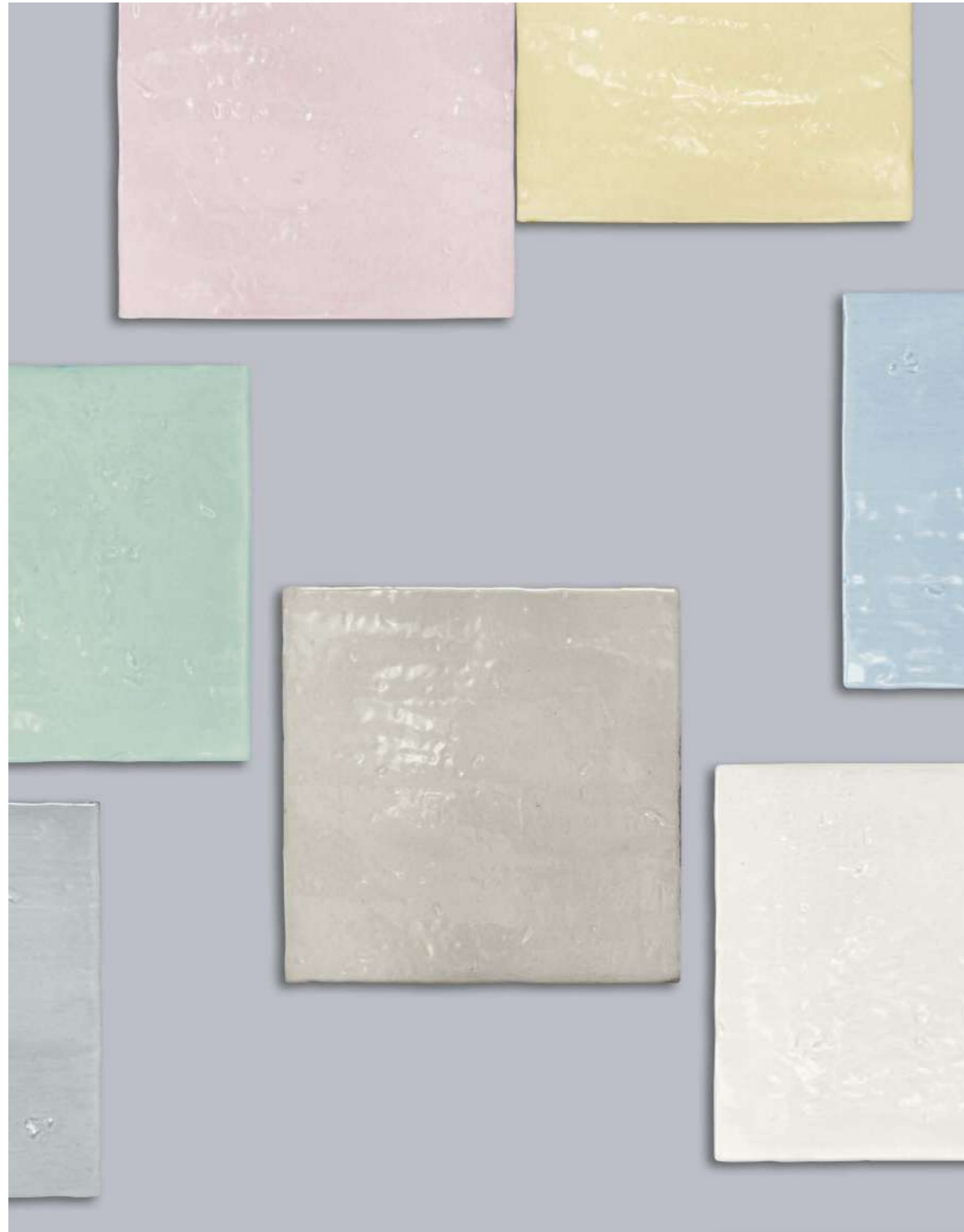
white body 13,2X13,2