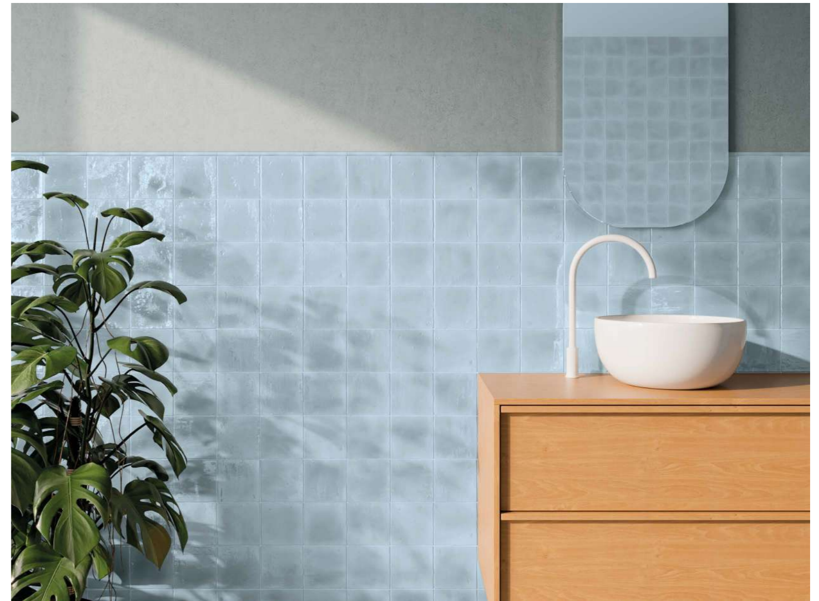
NADOR SKY/13,2X13,2 · ING NADOR SKY/1,5X13,2