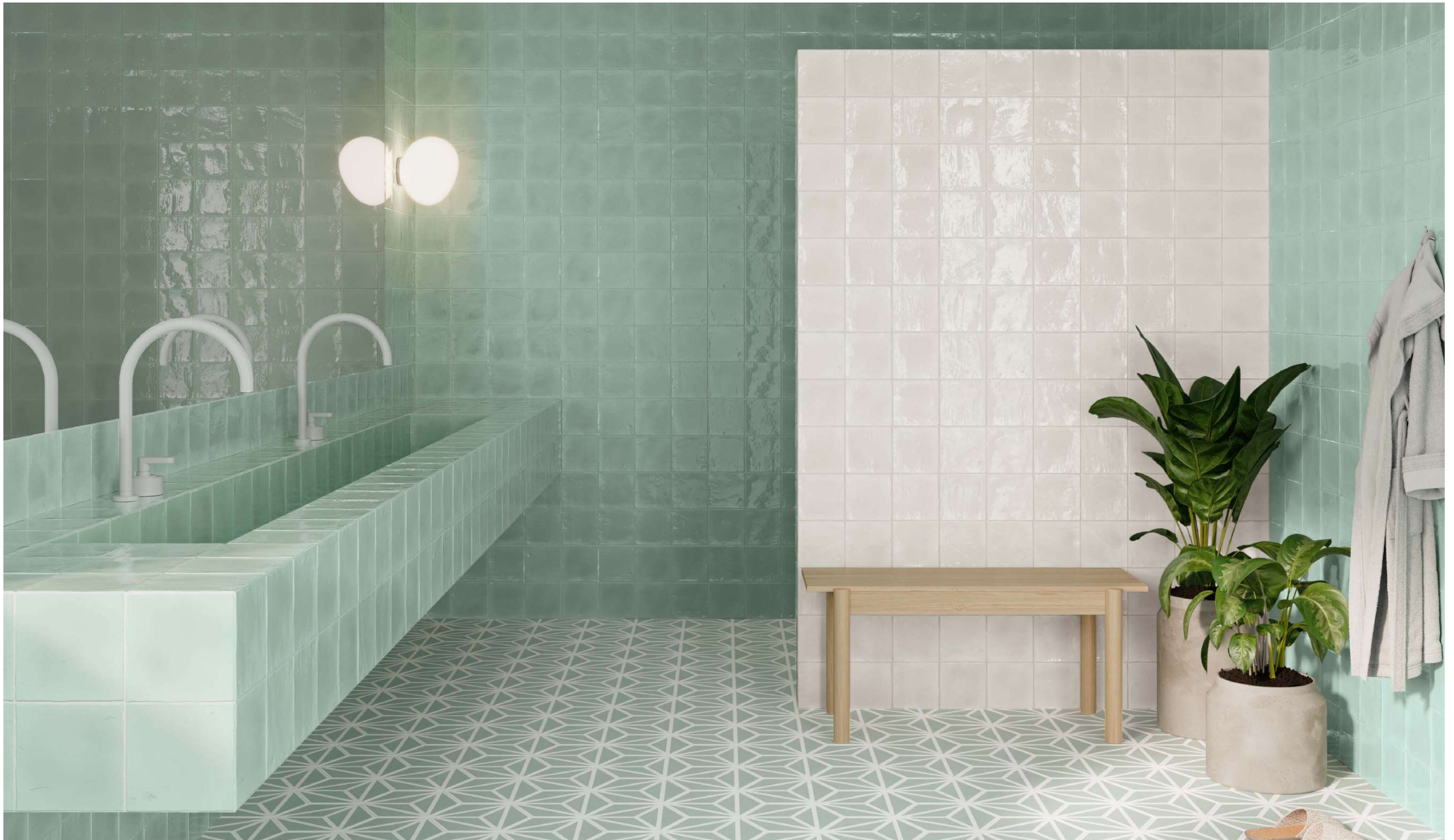
NADORMINT/13,2X13,2 · NADOR WHITE/13,2X13,2 · VARADERO MINT/19,8,2X22,8