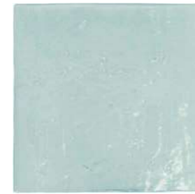
32016 NADOR MINT/13,2X13,2 Q44 (13,2x13,2 cm — 5 3 / 16 x5 3 / 16 "*) 50 patterns