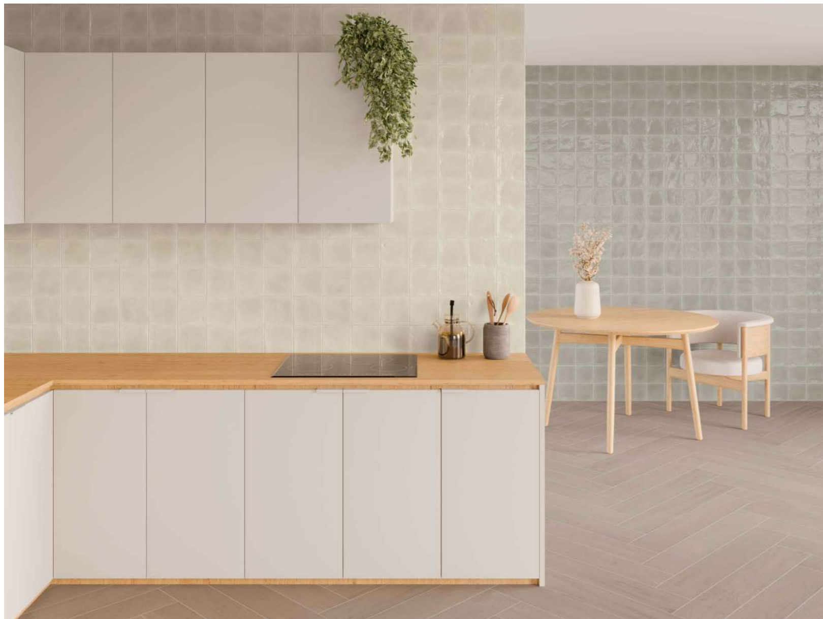
NADOR SAND/13,2X13,2 · NADOR TAUPE/13,2X13,2 · COLUMBUS TAUPE/60