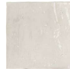
32021 NADOR SAND/13,2X13,2 Q44 (13,2x13,2 cm — 5 3 / 16 x5 3 / 16 "*) 50 patterns