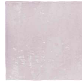
32018 NADOR PINK/13,2X13,2 Q44 (13,2x13,2 cm — 5 3 / 16 x5 3 / 16 "*) 50 patterns